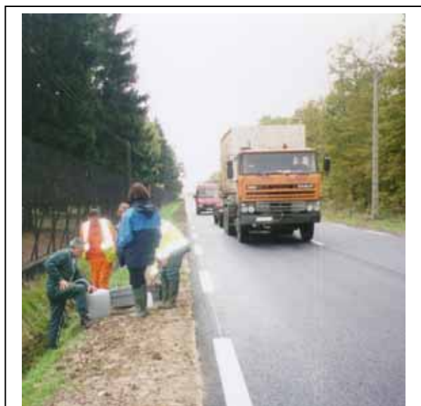
Sampling of infiltrated water at the RN76 (Romorantin, France) experimental site.

The infiltrated waters appeared weakly polluted. The concentrations of heavy metals and hydrocarbons were rather weak. The sub-standard quality of waters was mainly due to de-icing operations and was related to the concentrations of chloride and sodium. Pollution peaks for the COD and the suspended solids also appeared but the concentrations were rather weak.