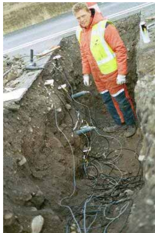
Installation of sensors in one cross section of the low volume Icelandic road described on page 2.